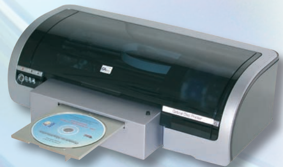
ODP 200 Thermal InkJet Disc Printer