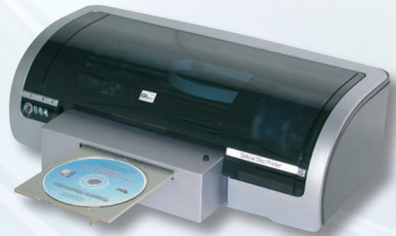
ODP 200 Thermal InkJet Disc Printer